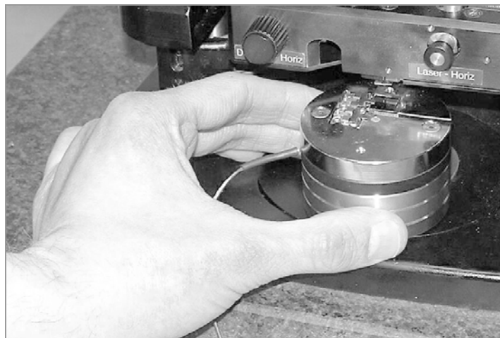
Figure 2: Modified sample puck with grounding layer and voltage cable connection